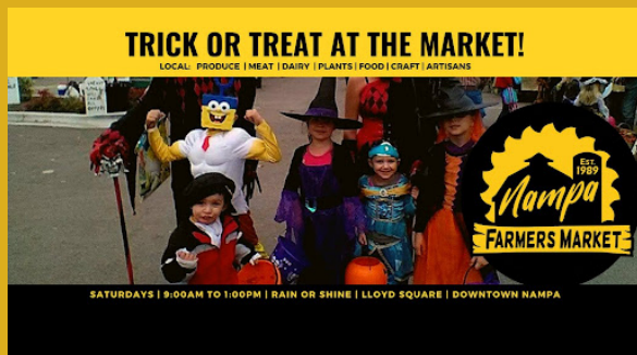
"TRICK OR TREAT AT THE MARKET"