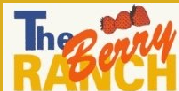
"TRUNK AND TREAT"